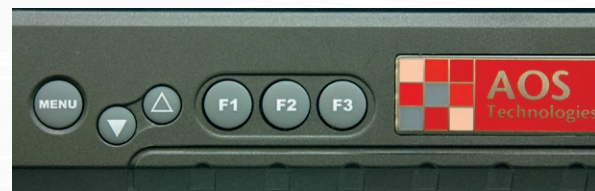
Dedicated control buttons for quick access to menu, exposure time, and user-specific camera settings.